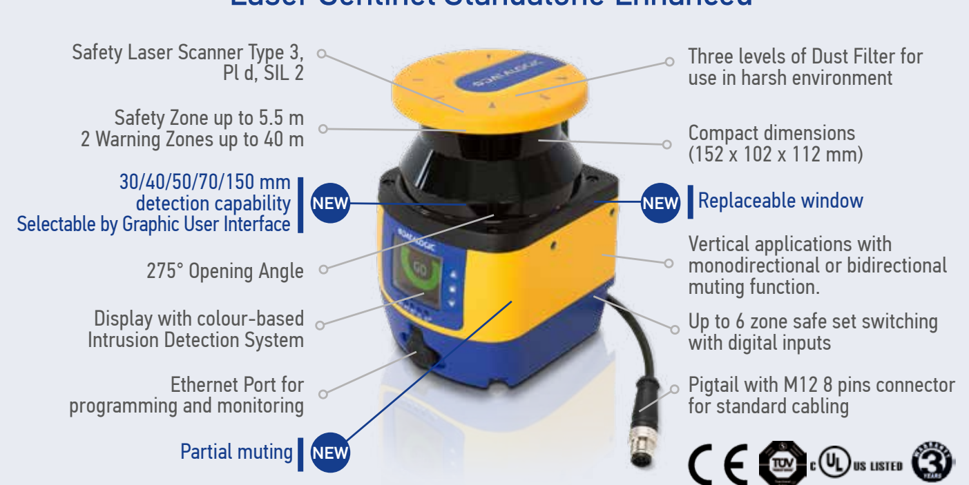
SLS-SA5 (Standalone) can be used for horizontal static or moving applications, as well as in vertical applications, eventually with muting function.